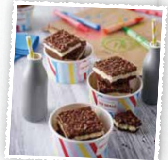
Layered chocolate crackle slice