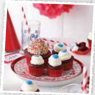
Mini red velvet cupcakes