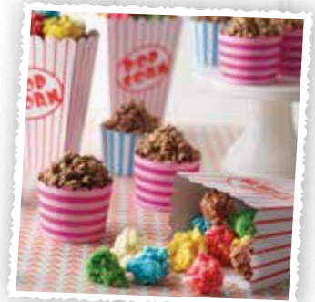
Chocolate crackle popcorn