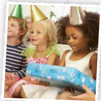
Inside party ideas