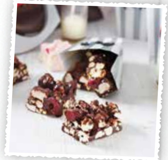
Popcorn rocky road