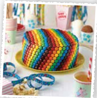
Rainbow tea cake with vanilla frosting and M&M's