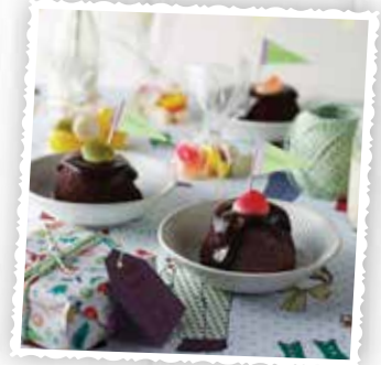
Mini chocolate mudcakes