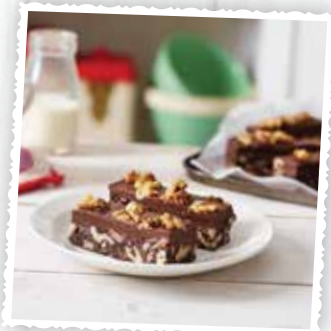
Popping candy hedgehog