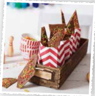
Popping candy bark